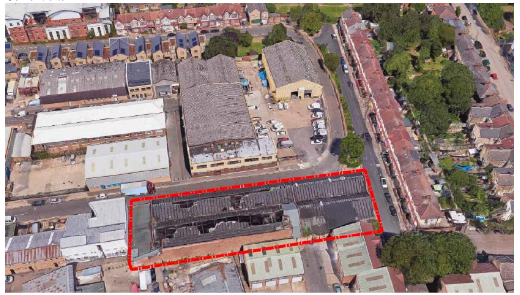
Site in context of Bernard Works Approved Development